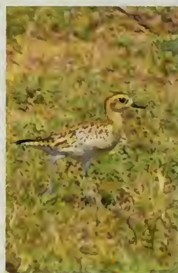
Figures 1–2. Pacific Golden Plovers Pluvialis fulva , Queen Elizabeth National Park, Uganda, 15 February 2007 (Allan Kirby)

Pluviers fauves Pluvialis fulva , Parc National Queen Elizabeth, Ouganda, 15 février 2007 (Allan Kirby)